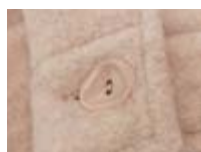
Real tagua nut buttons