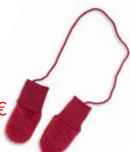
575570 052E- jasper mélange