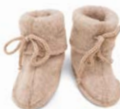
575582 087E- sand mélange