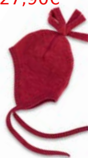
575450 052E- jasper mélange