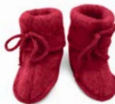
575582 052E- jasper mélange