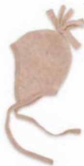
575450 087E- sand mélange